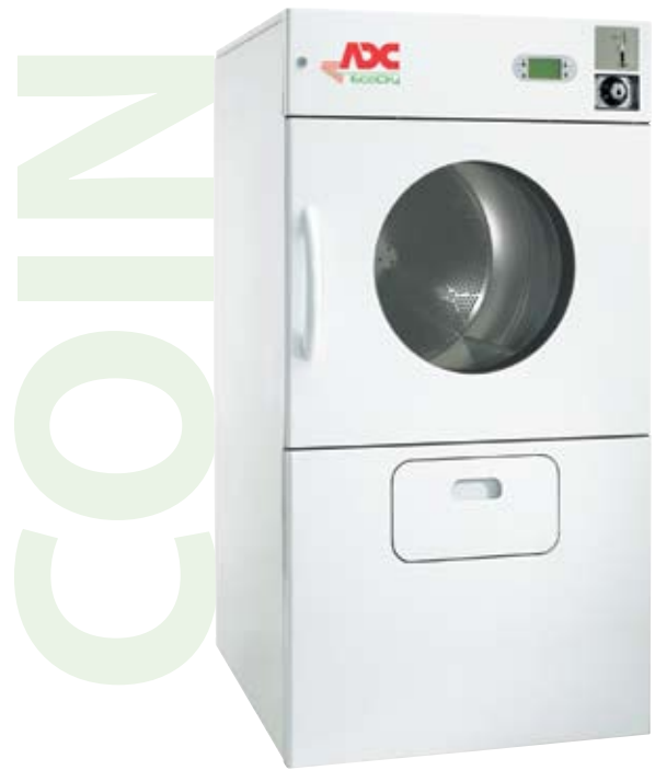
ES-35 Coin Dryer