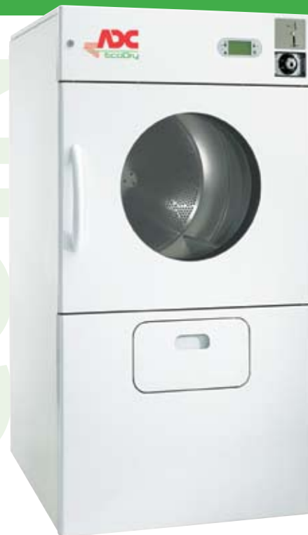
ES-50 Coin Dryer