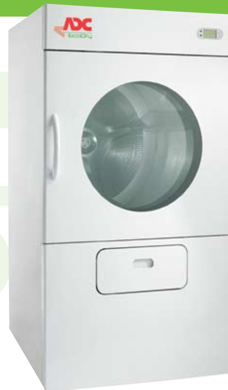
ES-50 OPL Dryer