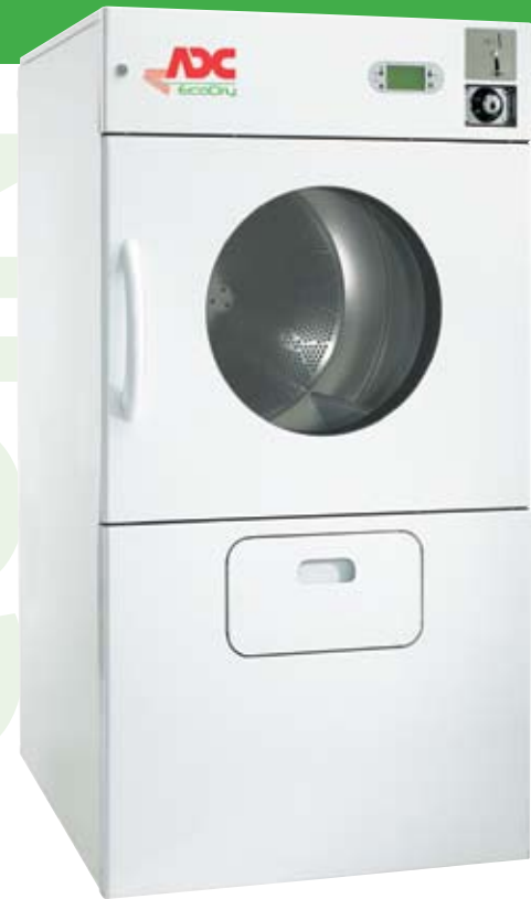
ES-76 Coin Dryer